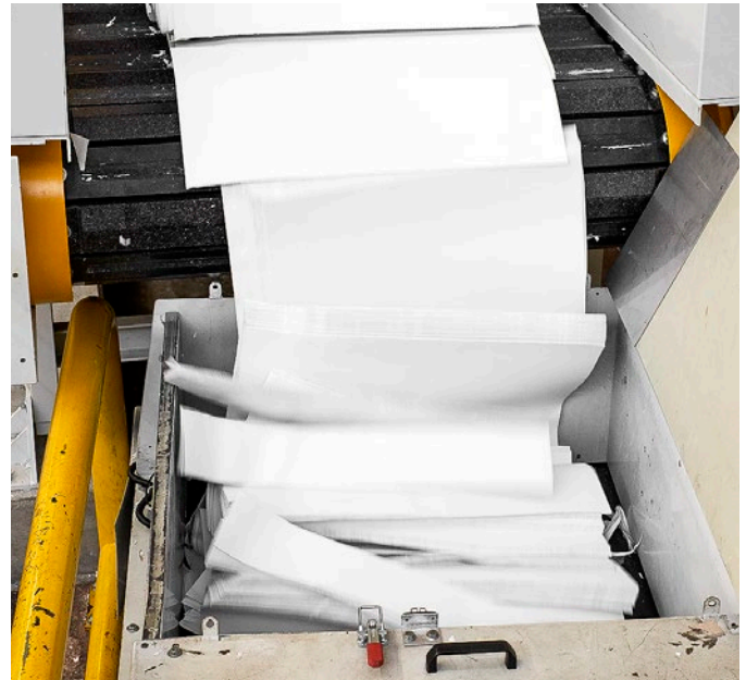
In a closed system, a conveyor belt transports the stack after the splitting process to a shredder with a downstream granulator.

Landqart AG has been working with the new plant for almost ten months. What is the verdict? Werner Vieli refers to greater speed. In that the rolls are split into small pieces, the shredder performance is increased by 20 per cent, compared to the previous system, he says. The rapid and logistically correctly arranged system for the splitting and shredding of the substrate rolls is an obvious benefit for the economic efficiency over the entire production operation for Landqart AG, Werner Vieli notes.